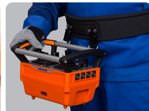
Carrying with the hip belt.