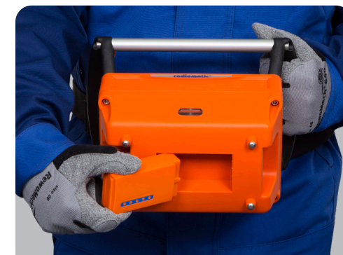
High-performing Li-ion exchange batteries, optional with capacity gauge.