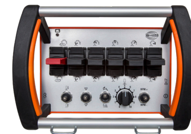
Version with linear levers.