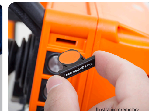
radiomatic® iLOG for the quick activation of a spare transmitter.